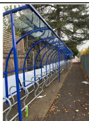
Bike Shelter WIP