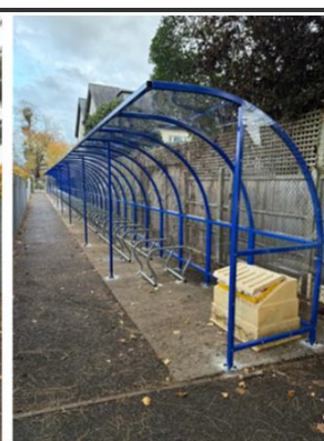
Bike Shelter completed