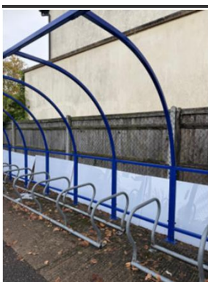
Bike Shelter WIP